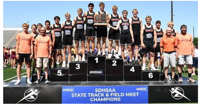
State Class "B" Track & Field Co-Champions Ipswich Tigers