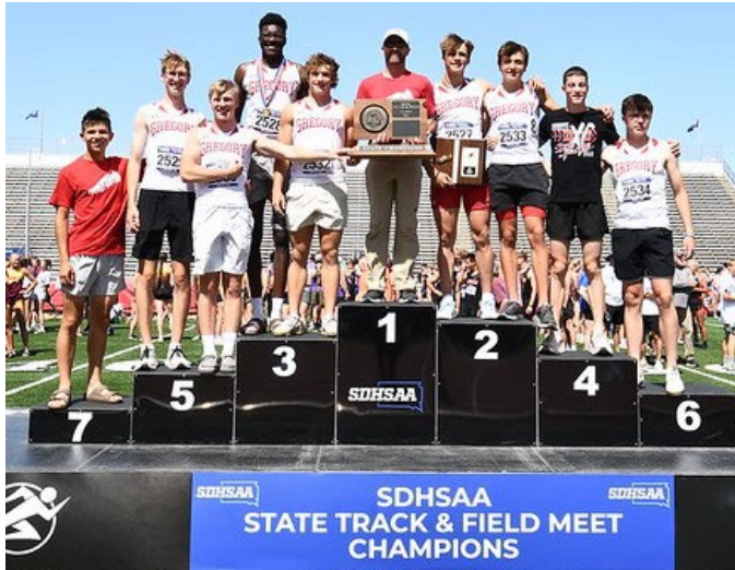
State Class "B" Track & Field Co-Champions Gregory Gorillas